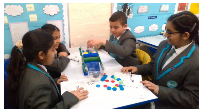
Year 6 have been working hard on representing algebraic expressions using scales.